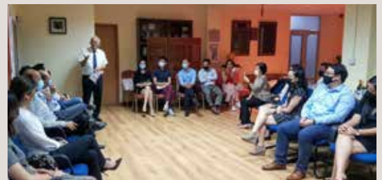
CBC President addressing the graduates & professionals