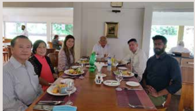
Lunch at Gymkhana Club with the Director of Art Vault