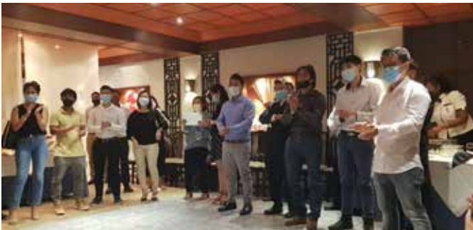
New CBC Members during the welcoming cocktail