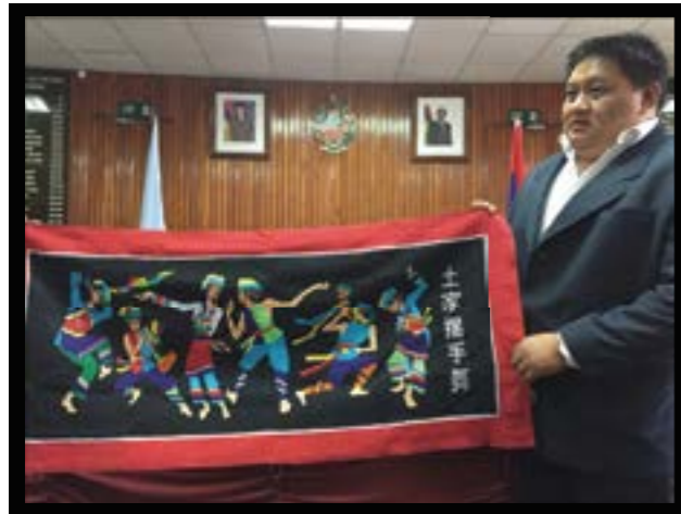
Mayor Ken Fong showing proudly the gift of hand embroidery, a specialty of Xiangxi Tujia & Miao Autonomous Prefecture