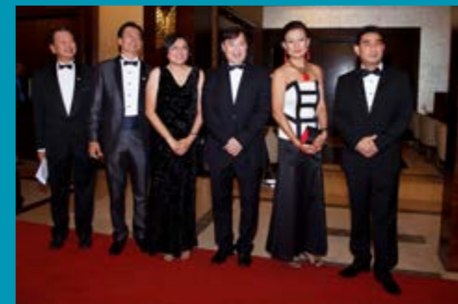
The CBC Welcoming Party