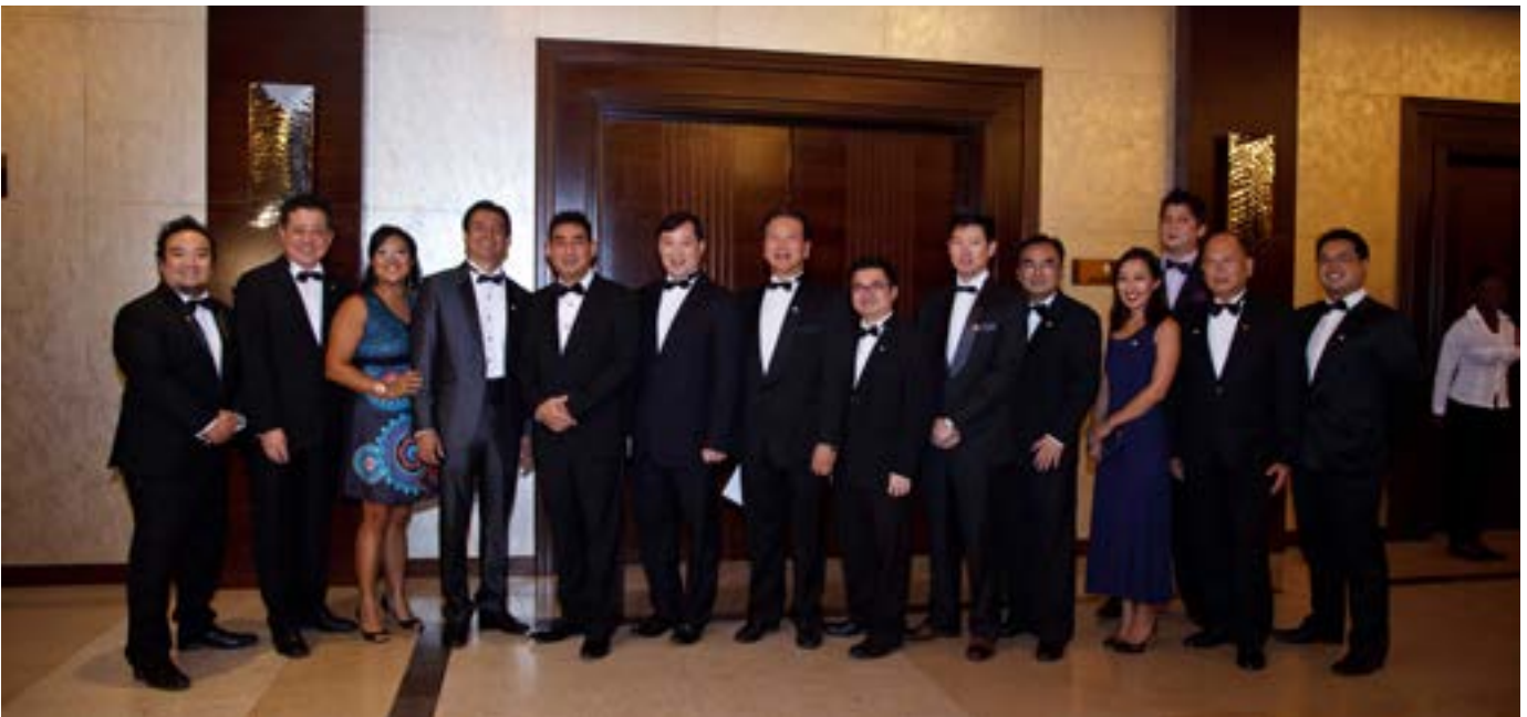
The CBC Board family picture